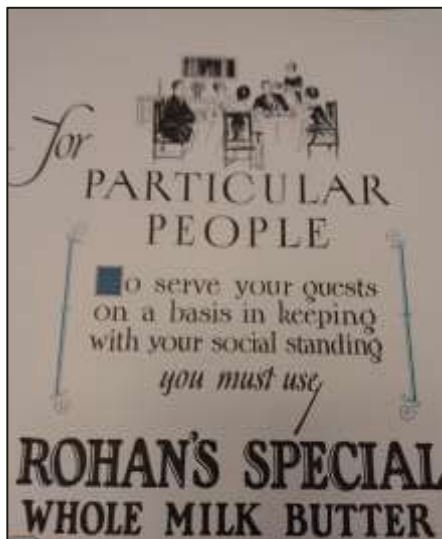
The ANDREW ROHAN COMPANY Cincinnati, O., U.S.A,